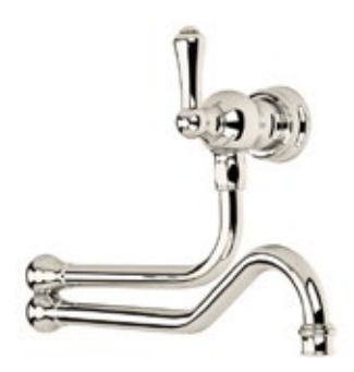
AU4717NI - Country Pot Filler in Nickel with Metal Lever