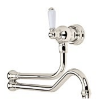
AU4417NI - Traditional Pot Filler in Nickel with White Porcelain Lever