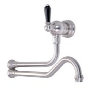
{\it AU4417PF~PORBTS-Traditional~Pot~Filler} in Pewter~with~Black~Porcelain~Lever