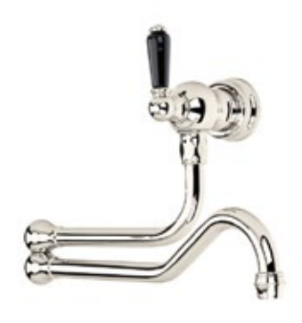
AU4417NI PORBTS - Traditional Pot Filler in Nickel with Black Porcelain Lever