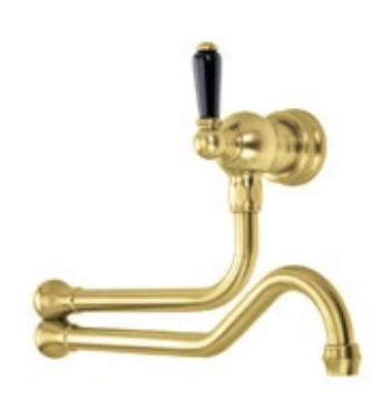
AU4417SB PORBTS - Traditional Pot Filler in Satin Brass with Black Porcelain Lever