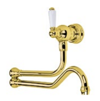
AU4417BR - Traditional Pot Filler in Polished Brass with White Porcelain Lever