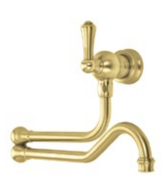
\ensuremath{\mathrm{AU4717SB}} - Country Pot Filler in Satin Brass with Metal Lever