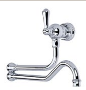
AU4717CP - Country Pot Filler in Chrome with Metal Lever