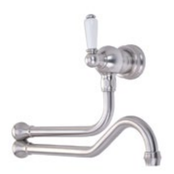
AU4417PF - Traditional Pot Filler in Pewter with White Porcelain Lever