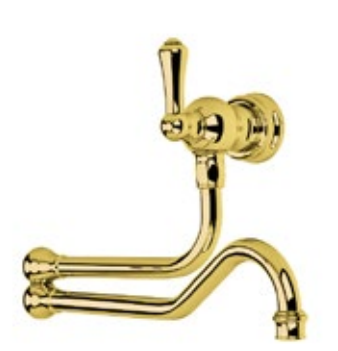
AU4717BR - Country Pot Filler in Polished Brass with Metal Lever