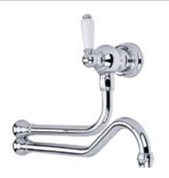
AU4417CP - Traditional Pot Filler in Chrome with White Porcelain Lever