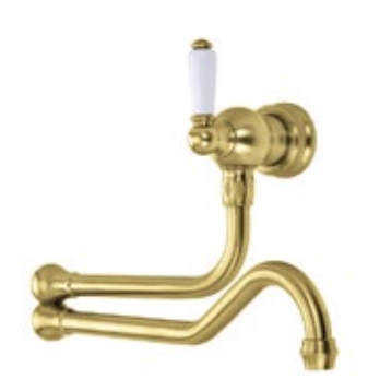
\begin{array}{lll} & AU4417SB \text{ - } Traditional Pot Filler in Satin} \\ & Brass \text{ with White Porcelain Lever} \end{array}