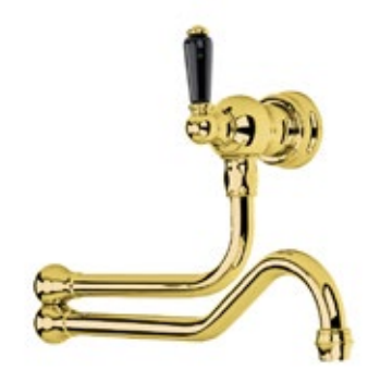
AU4417BR PORBTS - Traditional Pot Filler in Polished Brass with Black Porcelain Lever