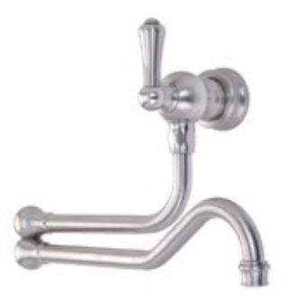
AU4717PF - Country Pot Filler in Pewter with Metal Lever