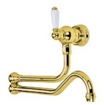
AU4417IG - Traditional Pot Filler in Gold with White Porcelain Lever