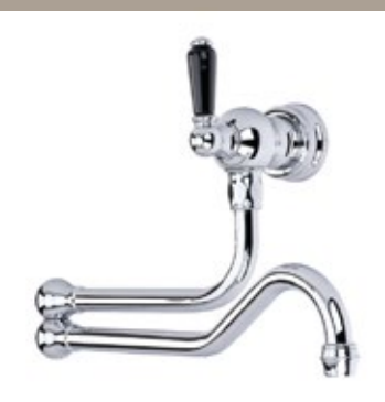
{\it AU4417CP\ PORBTS\ -\ Traditional\ Pot\ Filler} in Chrome with Black Porcelain Lever