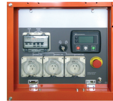
GL-9000 CONTROL PANEL