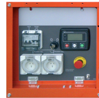
GL-6000 CONTROL PANEL

The Kubota super mini vertical diesel engines are water cooled and have increased performance for dependable horsepower and when direct coupled to the generator, provide continuous power output levels with minimum power loss.