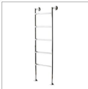
ART DECO ELECTRIC FLOOR MOUNTED TOWEL WARMER 550W X 1543H