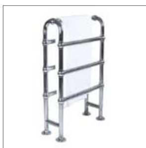
PREMIER ARCHED TOWEL WARMER WITH ELECTRICAL HEATING ELEMENTS THROUGH THE FLOOR