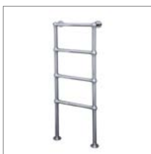
PREMIER TOWEL WARMER WITH ELECTRIC HEATING ELEMENT 525W X 1238H