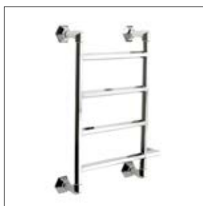
ART DECO TOWEL WARMER WITH LEFT OR RIGHT HAND HORIZONTAL ELEMENT 700W X 986H